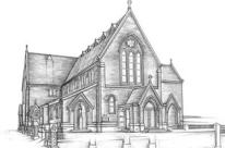
ST BENEDICT'S 1 ST BENEDICT'S ST NEWTON, AUCKLAND