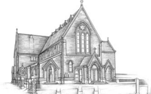
ST BENEDICT'S 1 ST BENEDICT'S ST NEWTON, AUCKLAND