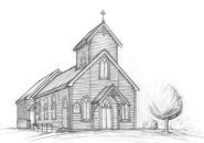
ST JOHN THE BAPTIST