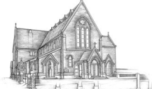
ST BENEDICT'S 1 ST BENEDICT'S ST NEWTON, AUCKLAND